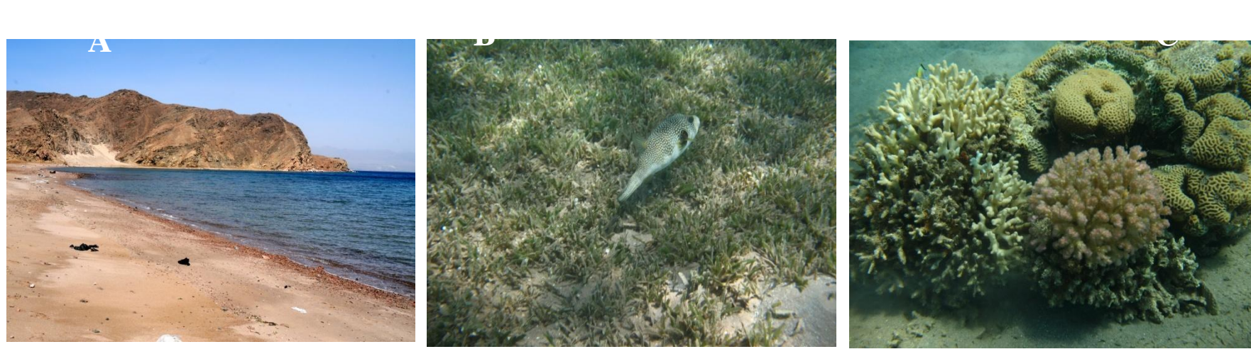
Figure 2 Marine Transect 5.

Graphic representations of vertical and horizontal sections of 100 meters from the mean sea level showing approximate distribution of different bottom types and their associated biodiversity (top), and photographic records of selected features of sections of the transect (A to C).